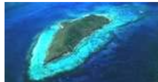
Buck Islands, US Virgin Islands

really is. The 5000 acre area consist of some of the most beautiful deep water diving,